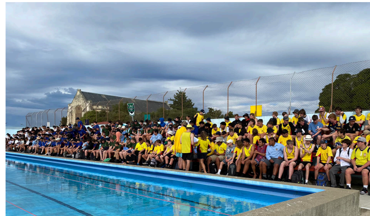
The extensive grounds provide outstanding recreational and sporting facilities onsite.

The 98 year old Hall of Memories is a Category 1 NZ Historic Places Trust building. Its Oamaru stone exterior, mature timber interior, resplendant with pipe organ, it is the 'heartbeat' of our school. Jacinda Ardern, NZ's former Prime Minister, on her visit to the school in 2019, specifically mentioned how impressed she was with the Hall of Memories – in her words “the most impressive school building she had ever been to.” The Hall is currently undergoing renovation including reroofing and engineering work in time for its centennial in 2027.