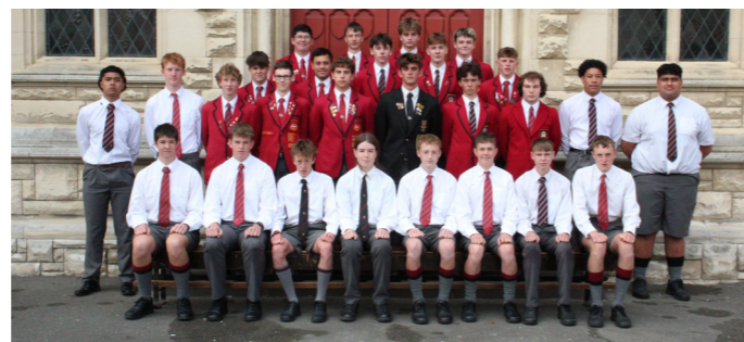
Waitaki Boys High School Achievement in NCEA 2024 (Participation based data)

On a Friday we have an Inspire Programme where our boys are engaged in classes that are "passions" of the staff and that they have selected. Classes include Cooking, Art Studio, Young Farmers, numerous Sports academics, Polyfest, Adventure Sports, to name but a few.